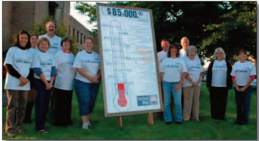
Tillamook County's United Way board at the start of the 2010 campaign

Together, we can weather these challenging times and be stronger for it on the other side.